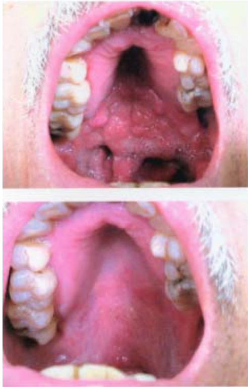
Fig. 1: patient, case 1, with mucocutaneous leishmaniasis showing lesions of the palate, uvula, and pharynx before (above) and 6 months after (below) immunotherapy was begun.