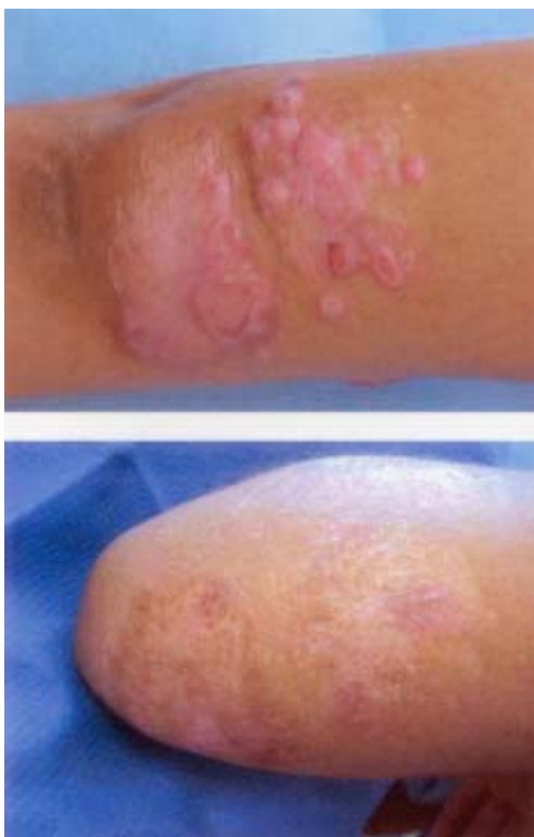
Fig. 2: extensive cutaneous plaques of early diffuse cutaneous leishmaniasis, case 6, before (above) and 7 months after (below) immunotherapy.

and 6 years old, cases 5 and 7; the predominant IgG subclass in the 10-year-old, case 6, was IgG4. Immunotherapy was not accompanied by significant changes in the isotype distribution of specific antibodies during an average one-year observation period (data not shown).