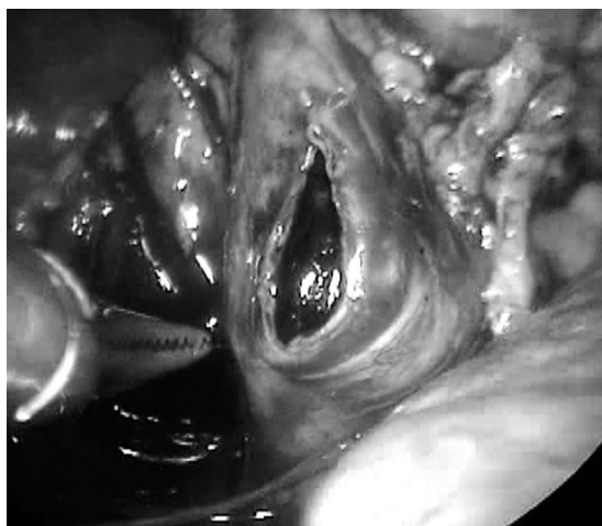
Figure 3. Choledochotomy must match the size of the larger stone.

These 9 patients were operated on with the intention of performing LCBDE; however, the conversion rate was 33.3%. Intrahepatic bile duct stones and embedded stones